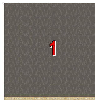
WILD DISCOVERY PD4603