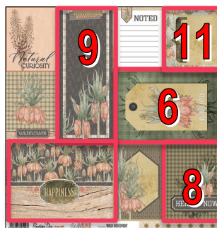
WILD DISCOVERY PD4603