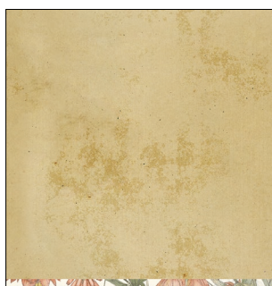
WILD AT HEART PD4602