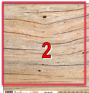
WILD AND FREE PD4601