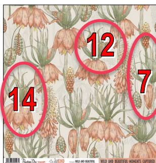
WILD AND BEAUTIFUL PD4600

Numbers in [red] indicate placement as noted in layout instructions.